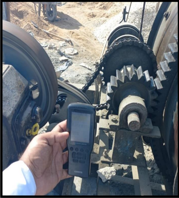
To check the Air Pollution level with the help of Formaldehyde Detector

Regarding environmental compliance and monitoring at site, the draft modified EDF-EMMP document is referred. Monitoring on-site was carried out for each contract package as per the corresponding EMMP. The draft modified EDF-EMMP document is yet to be approved by USAID. The environmental compliance report is separately submitted to USAID.