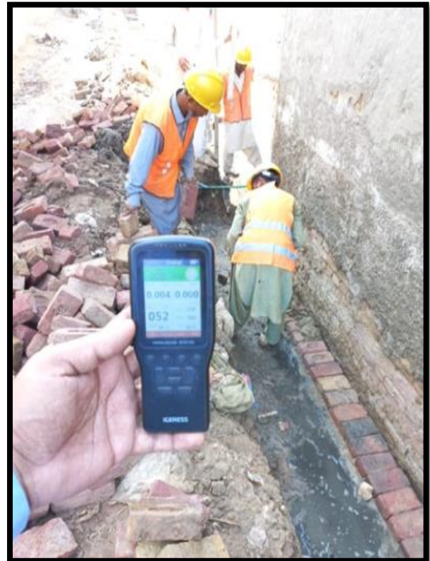
Monitoring of Air Pollution level with help of Formaldehyde Detector