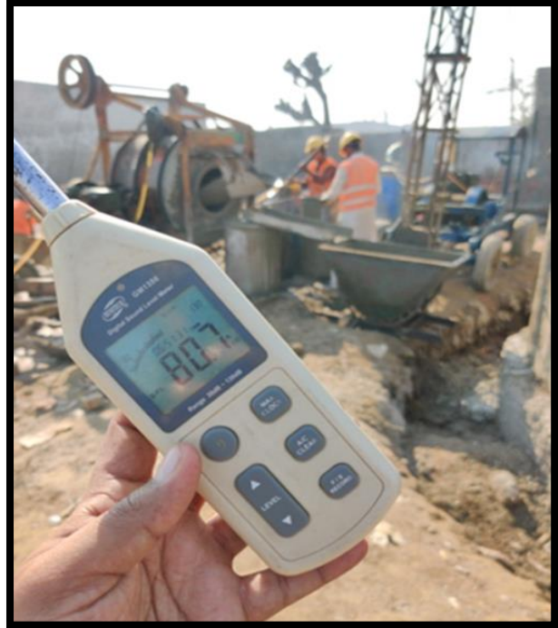
To check the Noise Pollution level with the help of (Digital Sound level Meter).