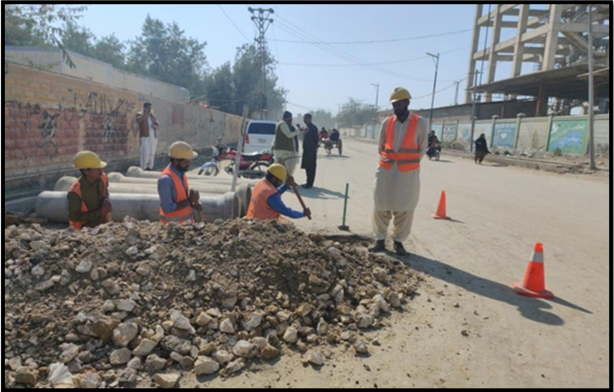
WW-08 (Zone B) Excavation of drain work in progress at street No. 1-E8 Gulab Machi Jacobabad