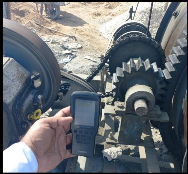
To check the Air Pollution level with the help of Formaldehyde Detector

Regarding environmental compliance and monitoring at site, the draft modified EDF-EMMP document is referred. Monitoring on-site was carried out for each contract package as per the corresponding EMMP. The draft modified EDF-EMMP document is yet to be approved by USAID. The environmental compliance report is separately submitted to USAID.