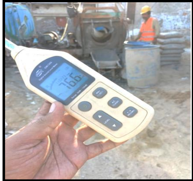
To check the Noise Pollution level with the help of (Digital Sound level Meter).