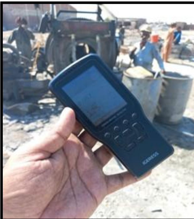
Monitoring of Air Pollution level during execution of work at Zone A Yard with the help of Formaldehyde