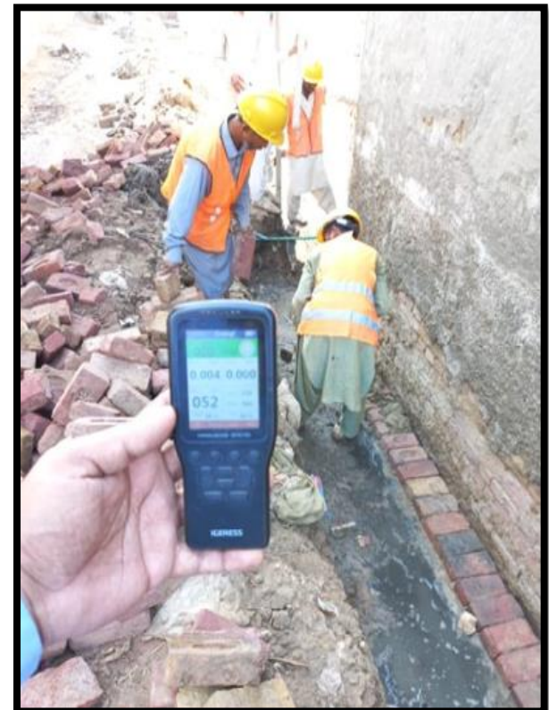
Monitoring of Air Pollution level with help of Formaldehyde Detector