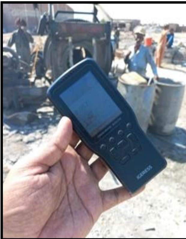
Monitoring of Air Pollution level during execution of work at Zone A Yard with the help of Formaldehyde