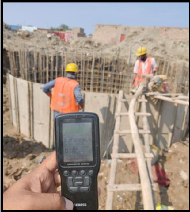
To check the Air Pollution level with the help of Formaldehyde Detector

Regarding environmental compliance and monitoring at site, the draft modified EDF-EMMP document is referred. Monitoring on-site was carried out for each contract package as per the corresponding EMMP. The draft modified EDF-EMMP document is yet to be approved by USAID. The environmental compliance report is separately submitted to USAID.